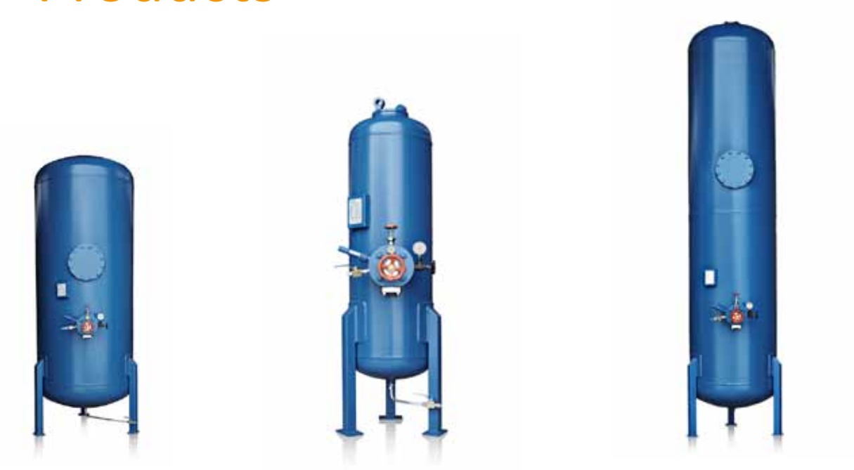
Containers and pressure equipment